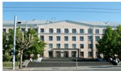
4. Severnaya Hotel (Gala Dinner), Lenina ave, 21 Гостиница "Северная" (торжественный ужин, пр. Ленина, 21)