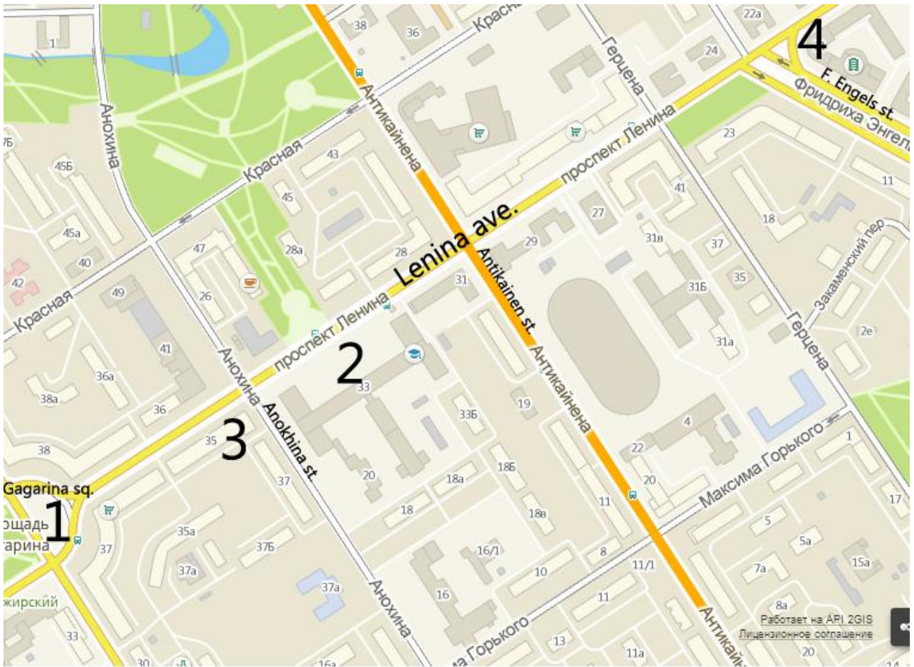
1 The Railway Station (Gagarina sq.) Ж/д вокзал (пл. Гагарина) 2. Petrozavodsk State University main campus (Lenina ave, 33) Петргу, главный корпус (пр. Ленина, 33)